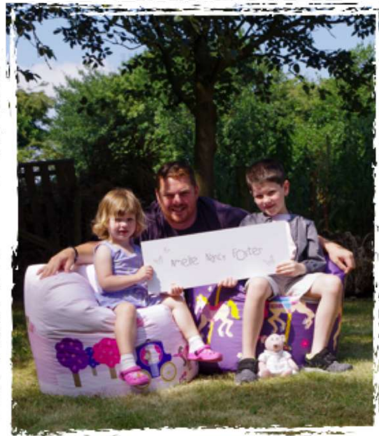
ACKNOWLEDGE THE IMPORTANCE OF SIBLINGS