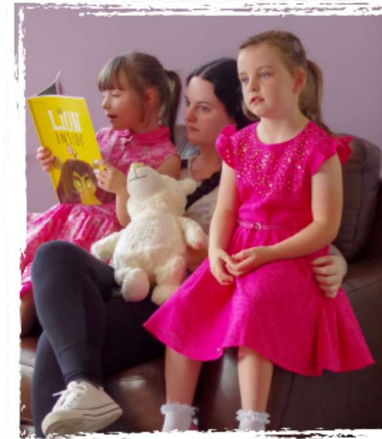
BRINGING CHILDREN TOGETHER