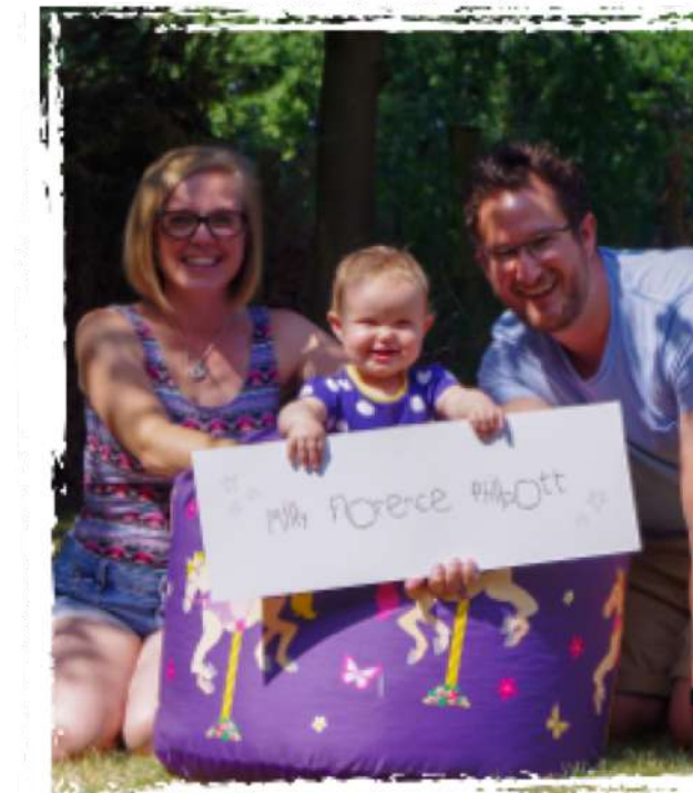
WORKING WITH CURRENT CHARITIES/ORGANISATIONS