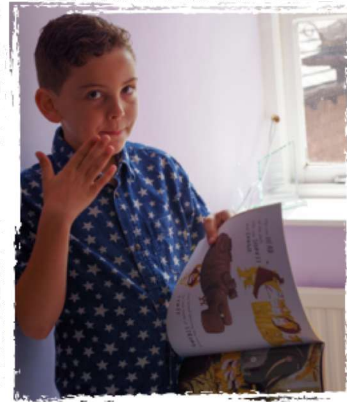
HELPING PARENTS SUPPORT THEIR OTHER CHILDREN