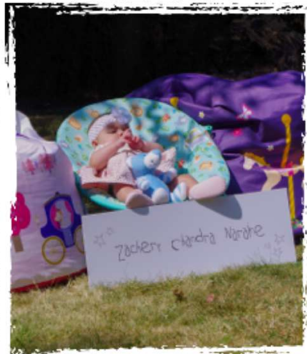
WORKING TOWARDS COPING STRATEGIES